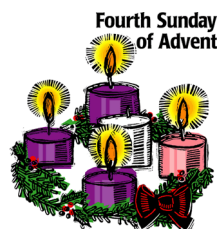
Fourth Sunday of Advent